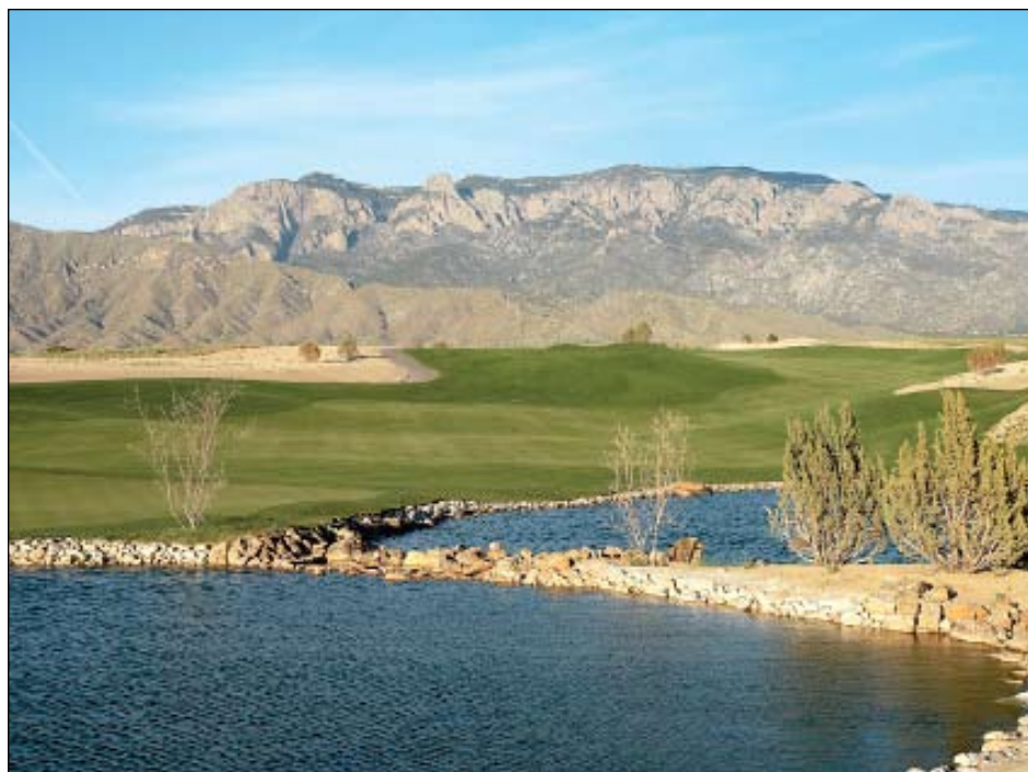
Continued on page 9

Stretching from 4,900 to over 7,700 yards from the back tees and routed through the rugged, high-desert landscape,