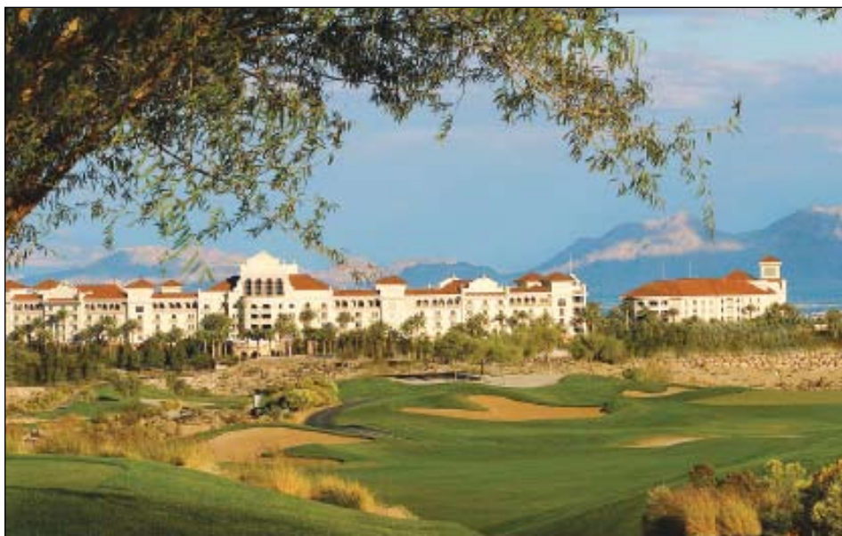
JW Marriott Las Vegas Resort & Spa view from TPC Las Vegas.